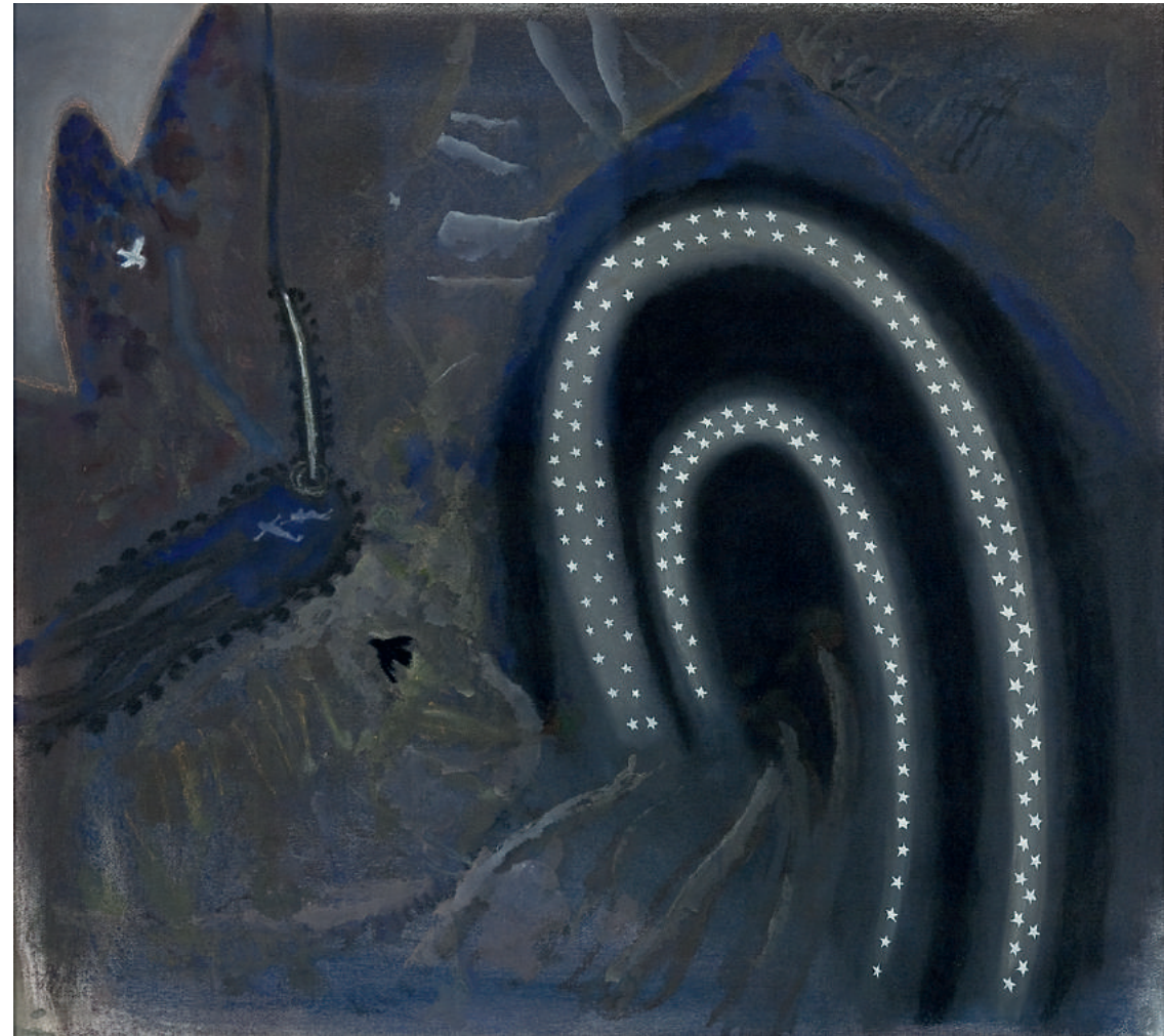
Creation landscape: Darkness and light (study) 1988