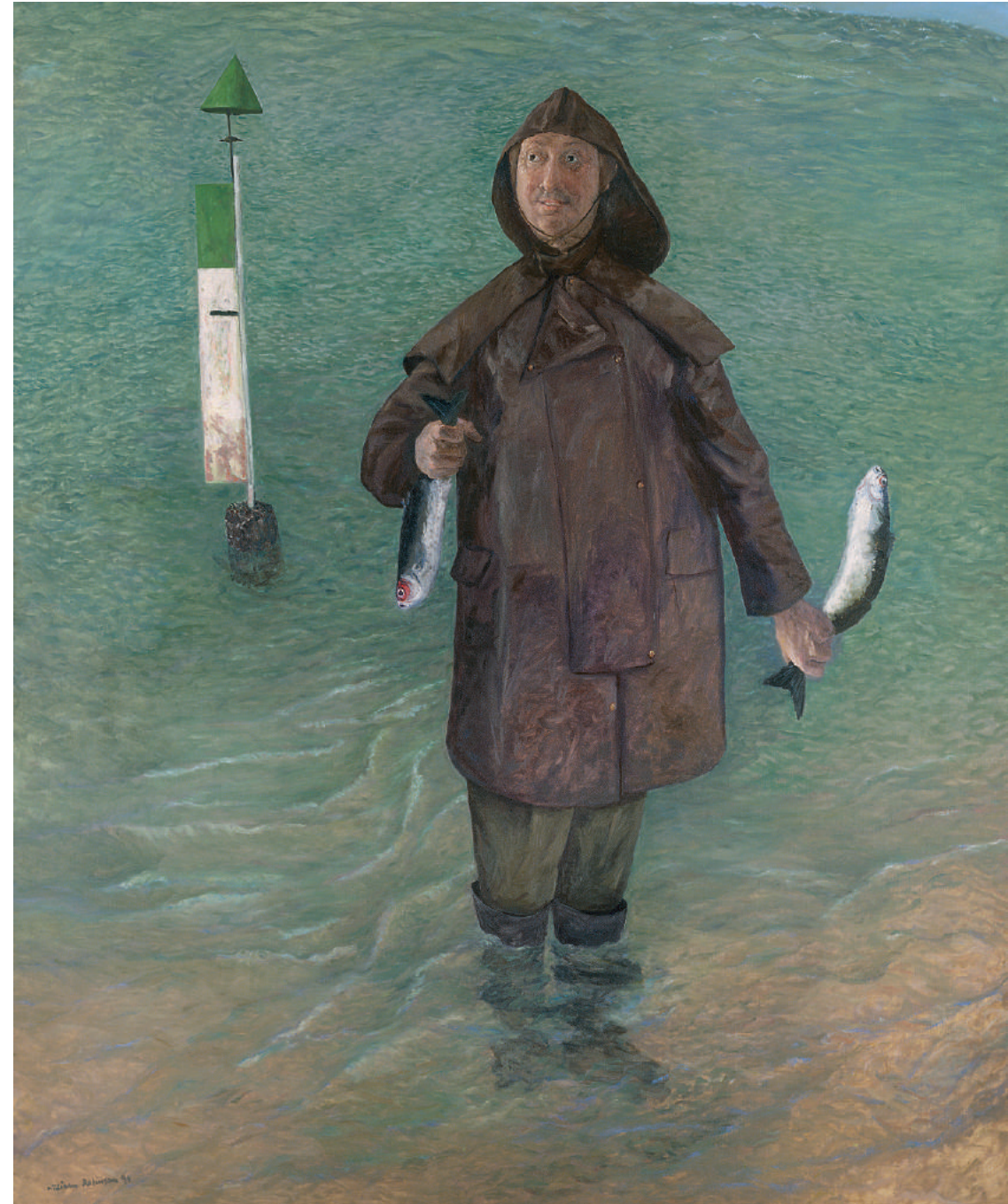
Self-portrait with stunned mullet 1994 Oil on canvas Private collection, Brisbane