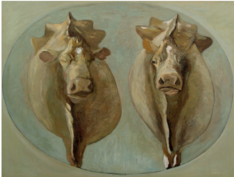
Two springing Guernseys 1979