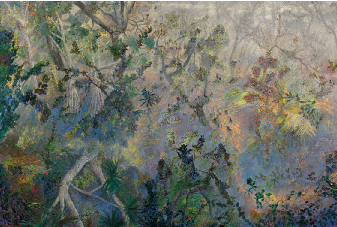
Tone poem: Morning 2008 Oil on canvas QUT Art Collection Purchased 2008 through the William Robinson Art Collection Fund