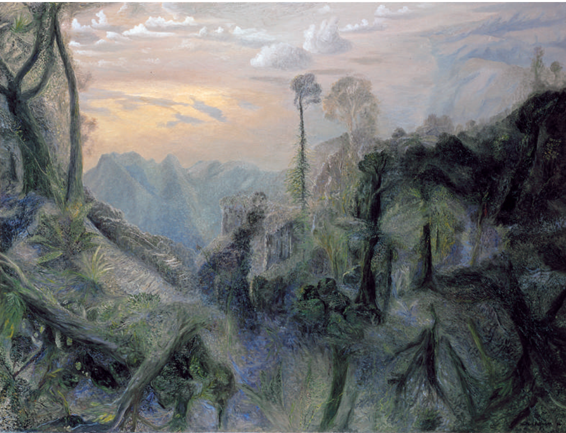
The sea with morning sun from Springbrook 1996 Oil on canvas Private collection, Sydney