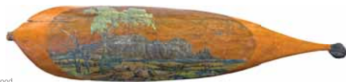
06. Albert Namatjira, Spear Thrower , c. 1938, incised and painted mulga wood, 80 x 17 x 7 cm, courtesy The Legend Press