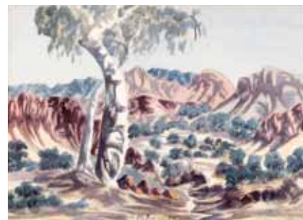
03. Otto Pareroutja, Untitled (Central Australian Landscape) , c. 1940s, watercolour on paper, 24 x 35 cm