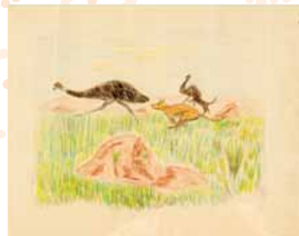
01. Albert Namatjira, Untitled (Animals Running), c. 1936, watercolour and pencil on paper, 29.5 x 23 cm