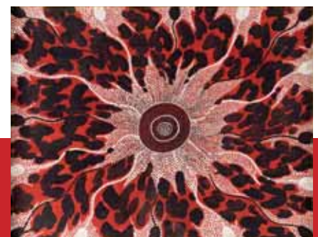
12. Kaapa Tjampitjinpa, Fire Story , c. 1975, acrylic on canvas on board, 55 x 70 cm, courtesy Aboriginal Artists Agency Ltd