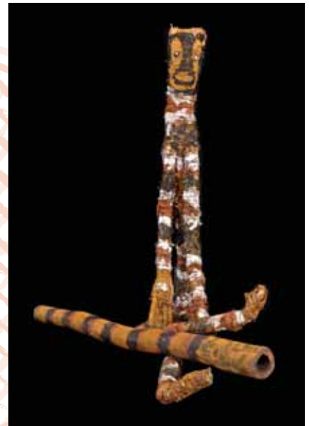
49. Lena Yarinkura, Wurum Spirit Figure (Fish Increasing Spirit) , 2006, ochres and mixed media, 68 x 63 x 30 cm, courtesy Maningrida Arts & Culture