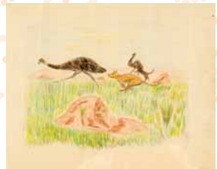
01. Albert Namatjira, Untitled (Animals Running), c. 1936, watercolour and pencil on paper, 29.5 x 23 cm