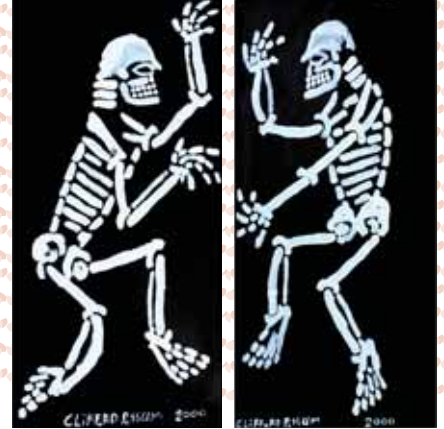
22. Clifford Possum Tjapaltjarri, Warlugulong (Right-facing Skeletons) , 2000, acrylic on canvas, two panels, 122 x 61.5 cm (each panel)

One of the most notable developments during the 1990s for the Kintore/Kiwirrkura school of painting has been the rise of significance of women artists. For many years women had assisted their male relatives on paintings, yet few Papunya-based women, save for those such as Pansy and Eunice Napangardi, painted in their own right. With the passing of many of the earliest Papunya painters, and the return to their Kintore homelands women started to come to the fore. By the mid 2000s women artists