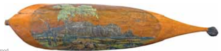
06. Albert Namatjira, Spear Thrower , c. 1938, incised and painted mulga wood, 80 x 17 x 7 cm