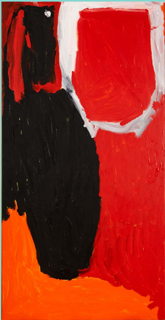
Mirdidingkingathi Juwarnda Sally GABORI Kaiadilt Dibirdibi Country 2010 acrylic on linen QUT Art Collection, donated through the Australian Government's Cultural Gifts Program by Patrick Corrigan AM, 2015