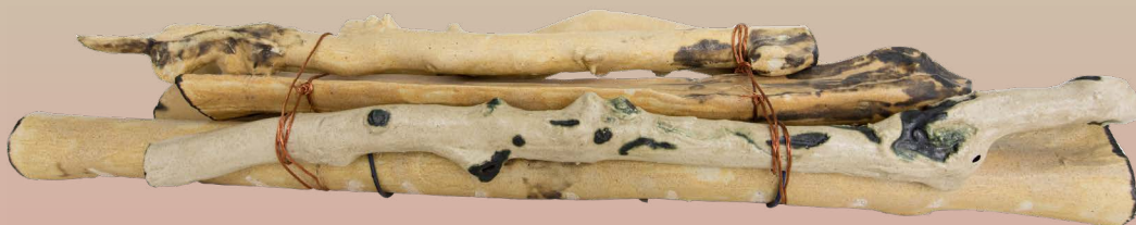
Yasmin SMITH Bundle of Ntaria Branches 2015 mid-fire slip with Hermannsburg wood ash glaze (river red gum, mulga, palm tree), black copper oxide wash, electrical wire. Courtesy the artist and The Commercial, Sydney. Photo Sofia Freeman.